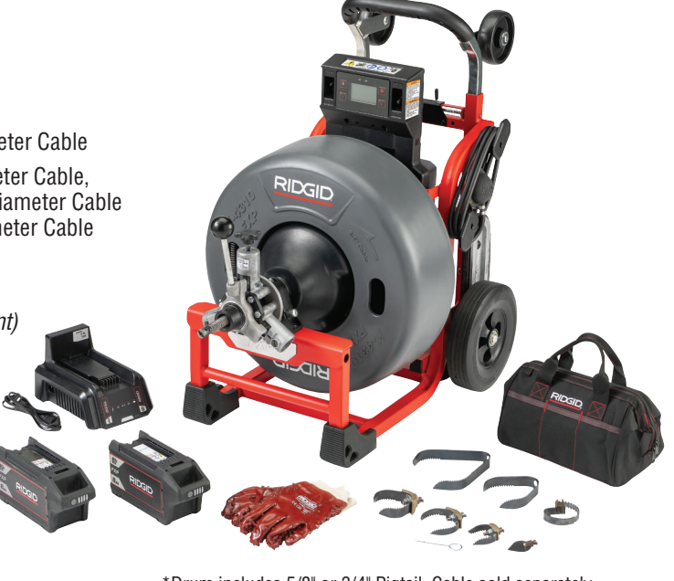
*Drum includes 5/8" or 3/4" Pigtail. Cable sold separately.

• Dimensions (Handle Down) ......37" x 22" x 35" (940mm x 559mm x 889mm)