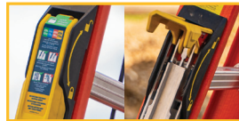
Micro-Adjust Handle with Lock/Unlock Indicator Label